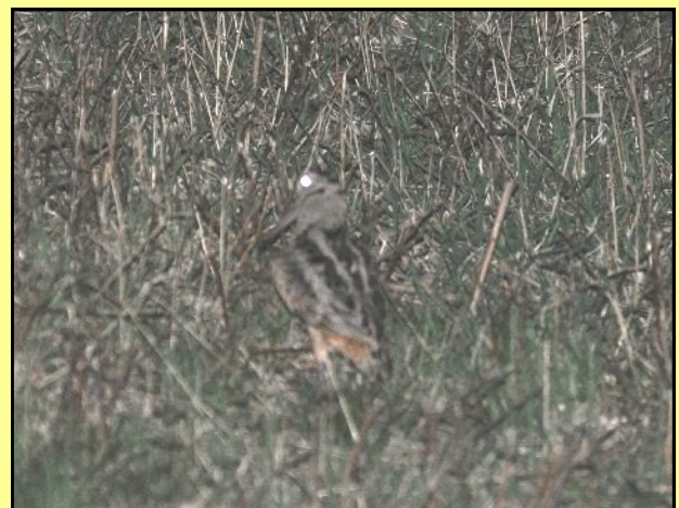
American Woodcock on March 29 at Humpback Rocks.